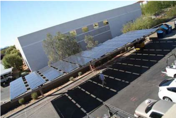
Solar PV carport structure.