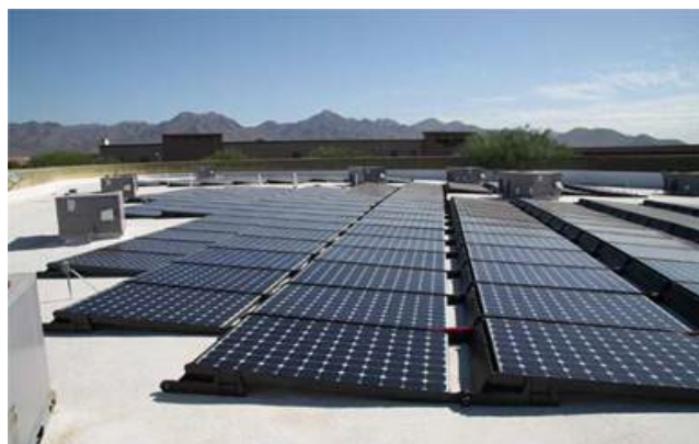
Low-slope solar PV panels below roof parapet.