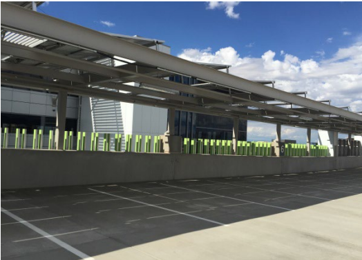
Solar PV parking shade canopy at top level of garage.