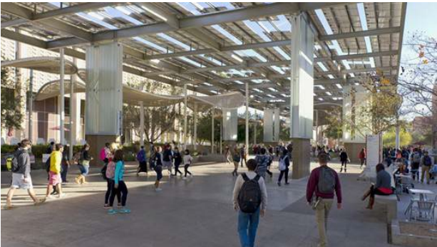
Pedestrian solar PV shade canopy.