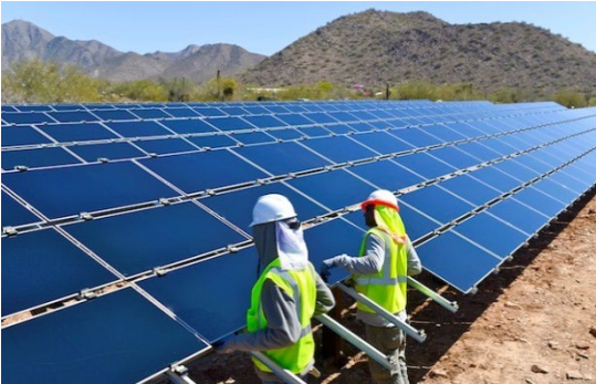
Ground mounted solar PV system.