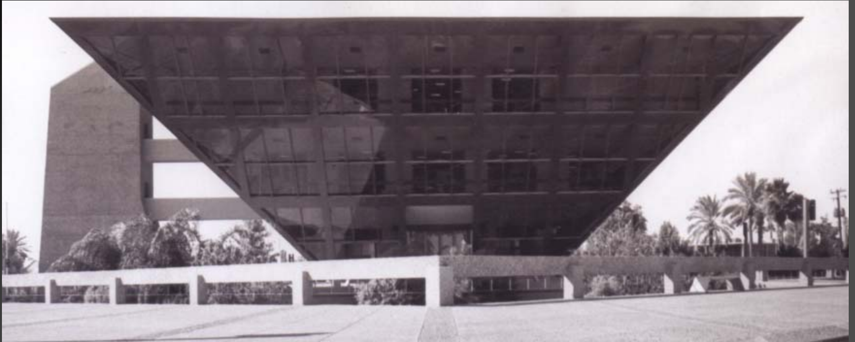
Tempe Municipal Building Michael Goodwin (1966-71)