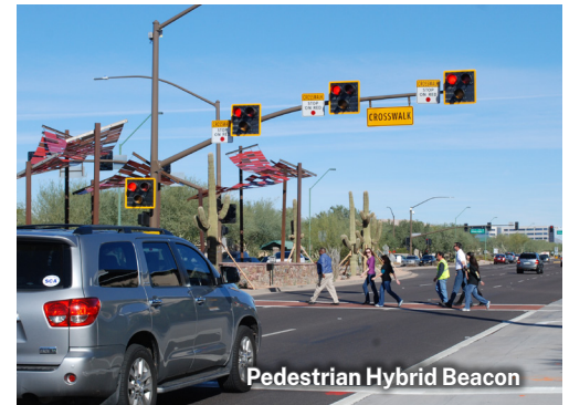
Pedestrian Hybrid Beacon

The McDowell Sonoran Mountain Preserve had 893,000 visits .