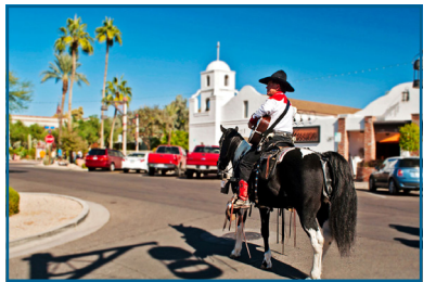
9. Old Town Scottsdale