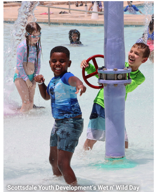
Scottsdale Youth Development's Wet n' Wild Day