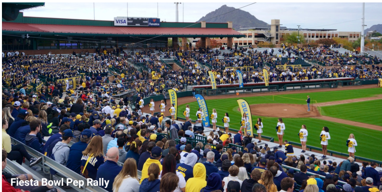
Fiesta Bowl Pep Rally

Every spring, Scottsdale garners national attention with an eclectic mix of sporting and cultural events that draw hundreds of thousands of spectators and millions of television viewers. Scottsdale resorts annually host Fiesta Bowl teams as Old Town becomes a focal point for pep rallies and fan parties. The Barrett-Jackson Collector Car Auction headlines a week of automotive attractions and becomes the star of more than 40 hours of live television coverage. This year, the WM Phoenix Open unfolded at the same time as Super Bowl LVII, which put Scottsdale squarely in the center of the sports world, hosting national TV coverage of the one of the largest galleries in golf along with 40 plus hours of live telecasts from the Historic Old Town ESPN Main Street Tailgate. The Scottsdale Arabian Horse Show — among the largest horse shows in the nation — and Scottsdale's festive Parada del Sol Parade and Rodeo follow later. In March, Major League Baseball takes center stage. Old Town Scottsdale serves as the spring home of the San Francisco Giants and makes the city a home base for visiting fans and media from across the nation.