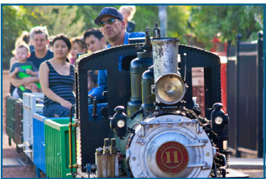
6. McCormick-Stillman Railroad Park