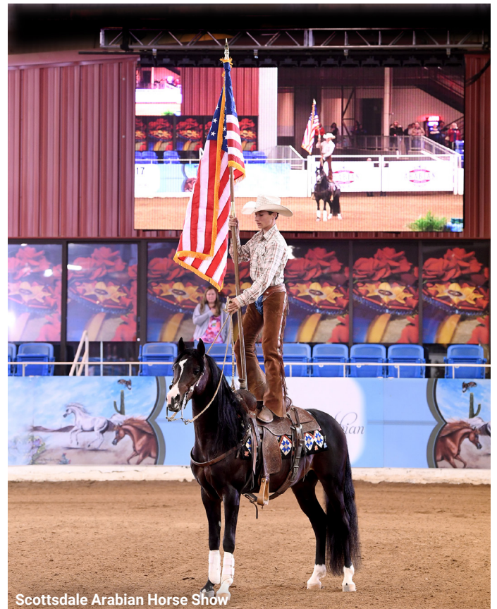
Scottsdale Arabian Horse Show