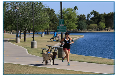
7. Indian Bend Wash Greenbelt