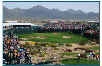
3. TPC Scottsdale