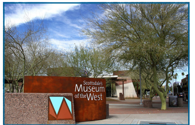
11. Scottsdale's Museum of the West