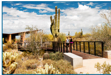
2. Preserve Gateway and Scottsdale's McDowell Sonoran Preserve