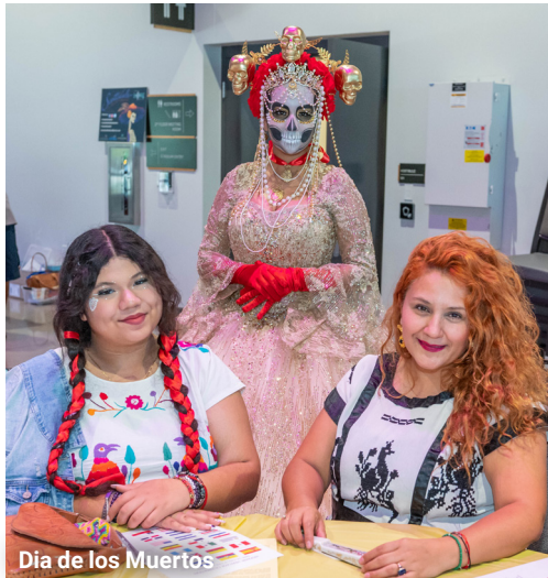
Día de los Muertos