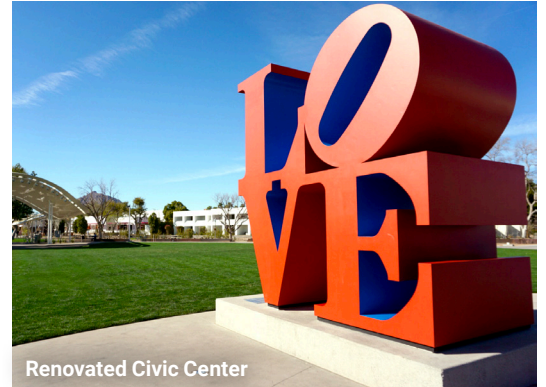
Renovated Civic Center