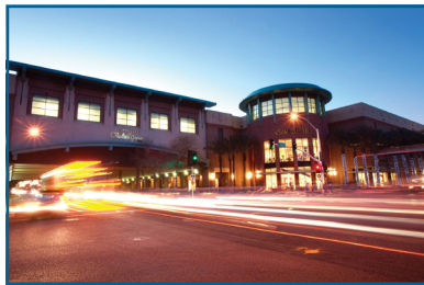
8. Scottsdale Fashion Square