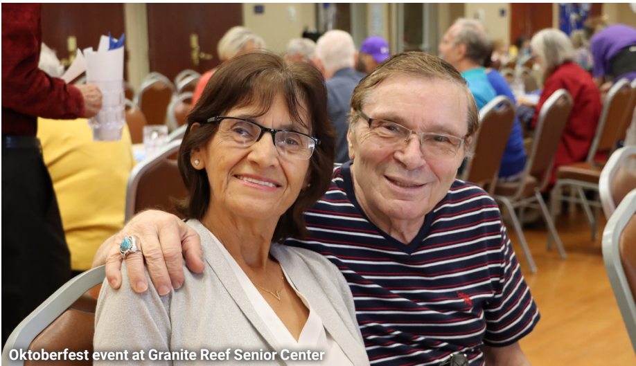
Oktoberfest event at Granite Reef Senior Center