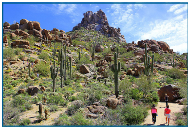
1. Pinnacle Peak Park