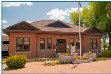
10. Scottsdale Historical Museum