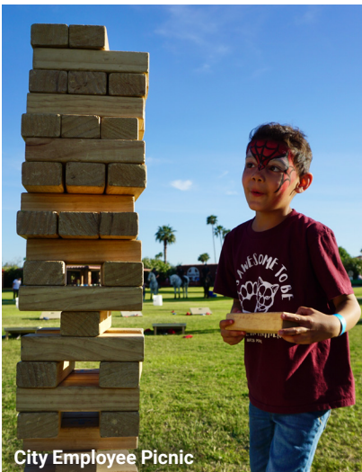
City Employee Picnic