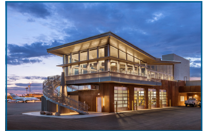
5. Scottsdale Airport/Airpark