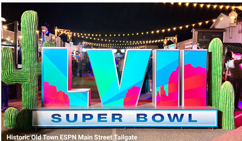
Historic Old Town ESPN Main Street Tailgate